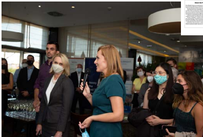
promo video highlighting personal experience of Slovak Fulbrighters was prepared

reception Fulbright Slovakia Research, together short